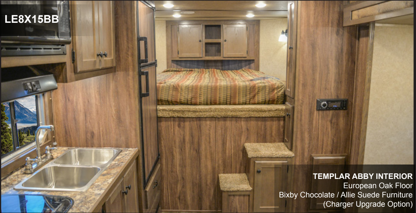
TEMPLAR ABBY INTERIOR European Oak Floor Bixby Chocolate / Allie Suede Furniture (Charger Upgrade Option)