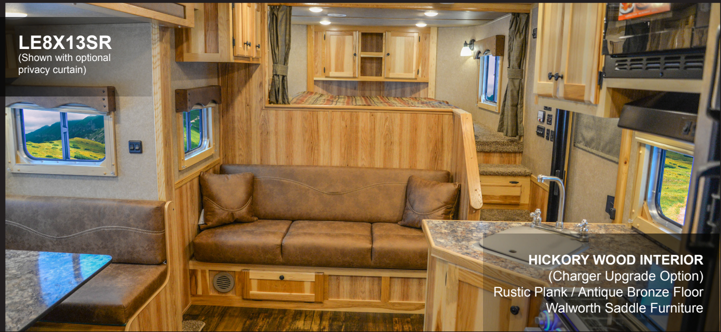
HICKORY WOOD INTERIOR (Charger Upgrade Option) Rustic Plank / Antique Bronze Floor Walworth Saddle Furniture