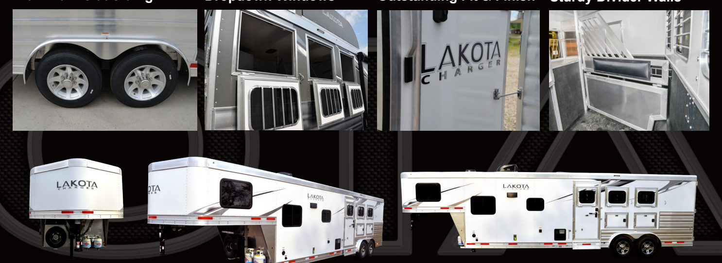
Outstanding Fit & Finish Sturdy Divider Walls